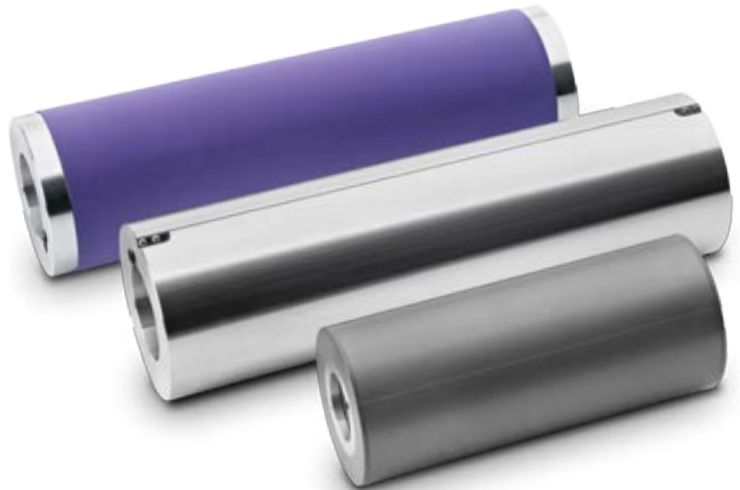
Variation of Aluminium Sleeves: rubber blanket aluminium surface hard anodized finish

The original sleeve technology remains unvaried. The additional advantages are obvious: increased reliability and better concentricity by means of a hard and precise surface.